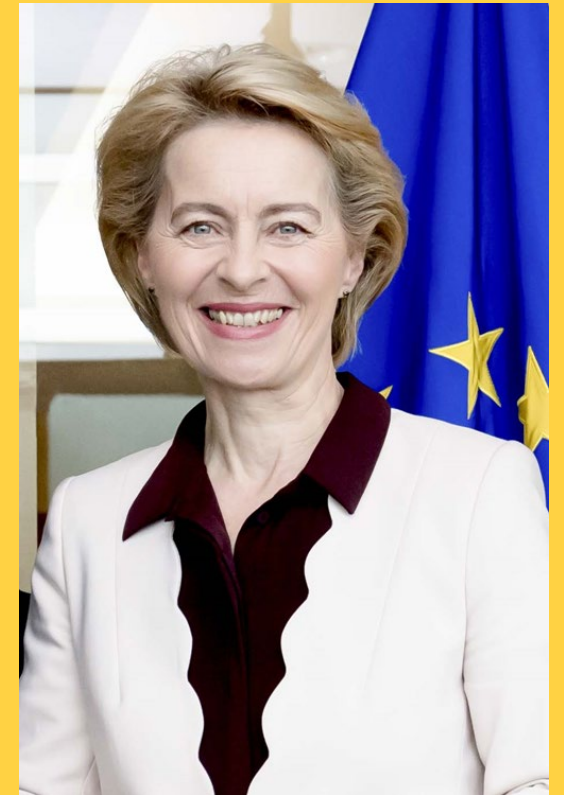
European Commission President Ursula von der Leyen

"All European citizens have the same right to health. NextGenerationEU's resources will therefore target the resilience of our health systems. The European funds will enable investments in new hospitals, better equipment and stronger healthcare systems." CoR speech, Oct 2020